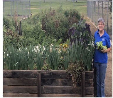
Plants in the Native Garden